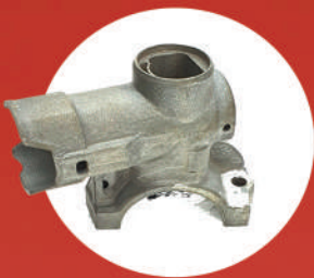
MAGNESIUM ALLOY MACHINED HOUSING FOR KEY LOCK