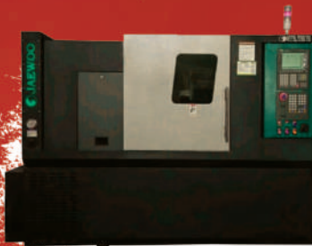
CNC LATHE MACHINE