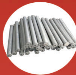
MAGNESIUM ANODE FOR WATER AND SOLAR SYSTEM