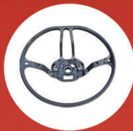
MAGNESIUM ALLOY PRESSURE DIE CASTING FOR STEERING