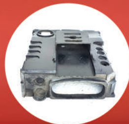
MAGNESIUM ALLOY PRESSURE DIE CASTING FOR HOUSING