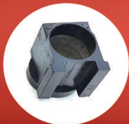
PRESSURE DIE CASTING FOR MONOCULAR BODY