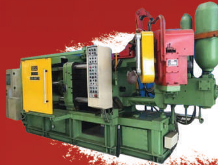
PRESSURE DIE CASTING MACHINE