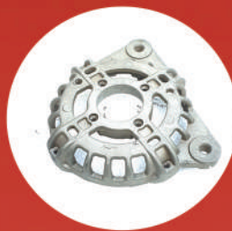
MAGNESIUM ALLOY PRESSURE DIE CASTING FOR COVER