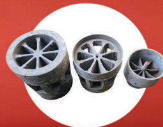
MAGNESIUM ALLOY SAND CASTING FOR ELECTRO DYNAMIC VIBRATION SYSTEM