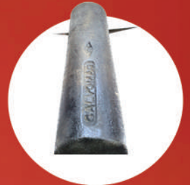
MAGNESIUM ANODE FOR REFINERIES