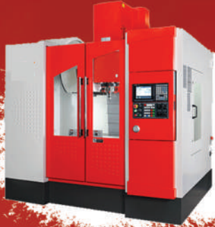
VERTICAL MILLING CENTER MACHINE