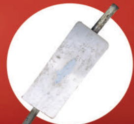
MAGNESIUM ANODE FOR REFINERIES